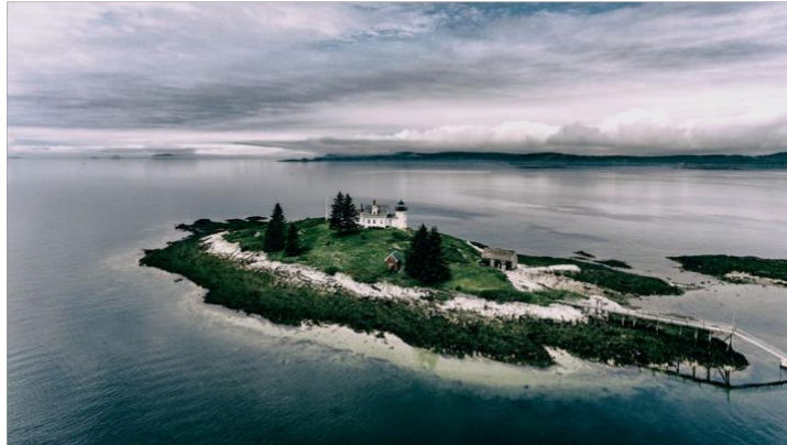
Pumpkin Island at the mouth of Eggemoggin Reach, Penobscot Bay. Looking west toward the mainland.

Gallery Position: 17 SKU: 41 Capture Date: 6/17/17 Camera: Phantom 4