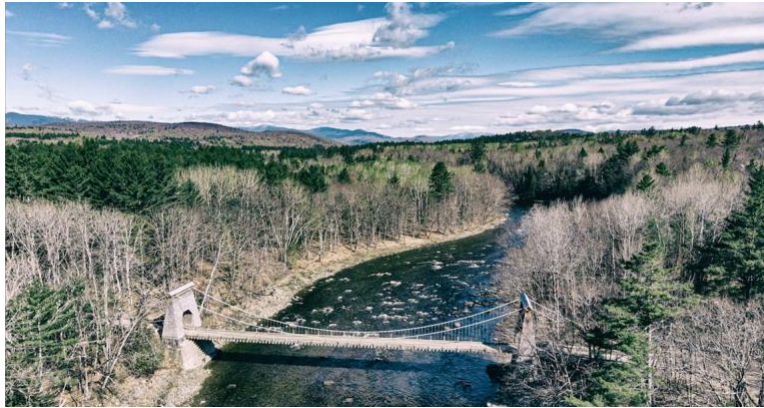
Wire bridge, New Portland Maine. 19 th century construction. 188 feet long, across Carrabassett River.

Gallery Position: 29 SKU: 84 Capture Date: 5/16/19 Camera: Mavic Air