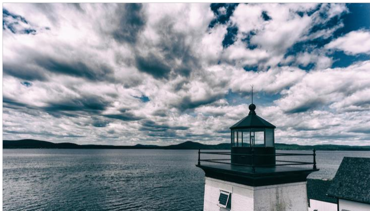
Light Tower, Grindel Point Lighthouse, Islesboro, ME.

Gallery Position: 14 SKU: 36 Capture Date: 6/15/17 Camera: Phantom 4