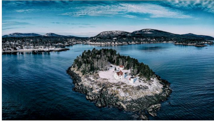
Curtis Island, Camden, Maine. View of lighthouse from the sea. Camden Harbor and mountains in background. Winter.

Gallery Position: 1 SKU: 90 Capture Date: 12/5/19 Camera: Mavic Mini