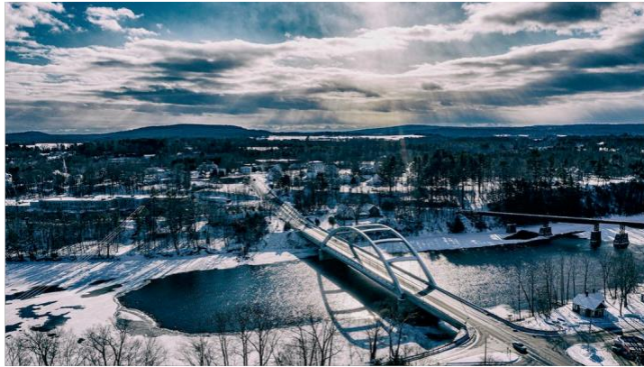
Kennebec River Bridge, Norridgewock, ME. Looking South, across river toward low winter sun. Shoe factory and village in background.

Gallery Position: 9 SKU: 94 Capture Date: 1/7/20 Camera: Mavic 2 Pro