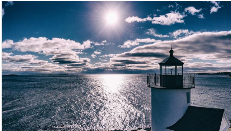
Light tower, Curtis Island. Looking east across Penobscot Bay into the winter sun.

Gallery Position: 2 SKU: 73 Capture Date: 12/4/18 Camera: Mavic Air