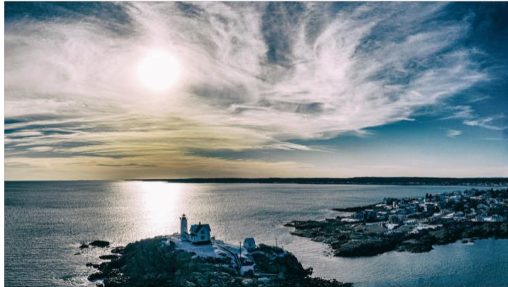
Nubble Lighthouse, looking south toward winter afternoon sun.

Gallery Position: 13 SKU: 92 Capture Date: 12/12/19 Camera: Mavic 2 Pro