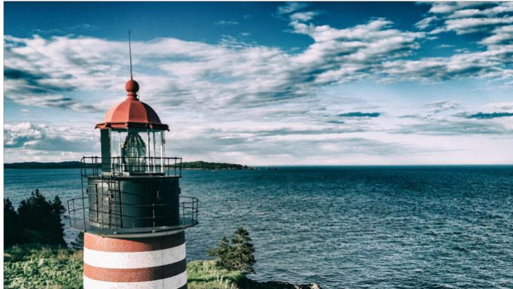
Light tower at West Quoddy Head. Lubec, Maine.

Gallery Position: 16 SKU: 34 Capture Date: 6/2/17 Camera: Mavic Pro