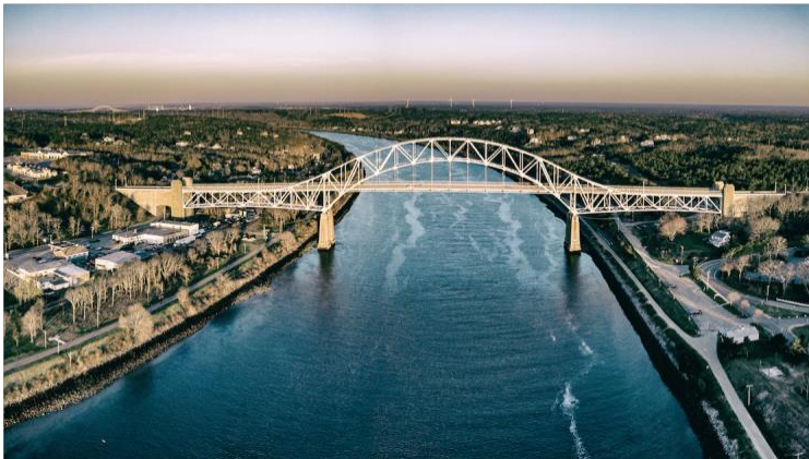
Sunrise at Cape Cod Canal. Sagamore Bridge with Bourne Bridge, RR Bridge and wind farm in distance.

Gallery Position: 22 SKU: 61 Capture Date: 5/2/18 Camera: Mavic Pro