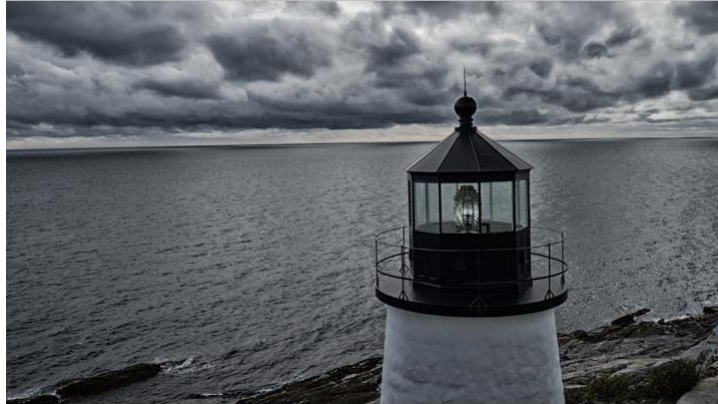
Pemaquid Point lighthouse, overlooking harbor.

Gallery Position: 15 SKU: 17 Capture Date: 10/27/16 Camera: Zenmuse X5