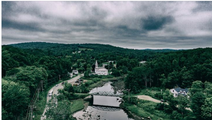
Brooklyn Rd. Bridge over Marsh Stream with town of Frankfort (1789) beyond. The oldest town on the Penobscot River, originally encompassing Winterport, Stockton, Prospect.

Gallery Position: 30 SKU: 112 Capture Date: 7/14/20 Camera: Mavic 2 Pro