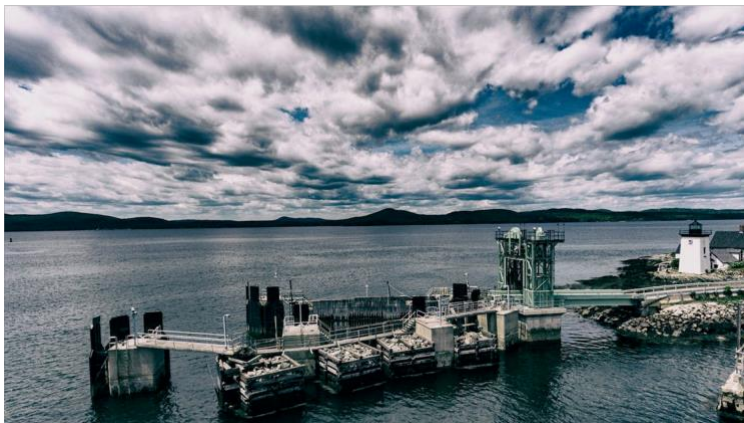
Ferry landing and lighthouse at Grindel Point, Islesboro, ME.

Gallery Position: 18 SKU: 37 Capture Date: 6/15/17 Camera: Phantom 4