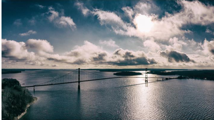
Bridge to Little Deer Isle across Eggmoggin Reach. Late fall: cold, windy, view toward a low mid-day sun.

Gallery Position: 21 SKU: 78 Capture Date: 12/7/18 Camera: Mavic Air