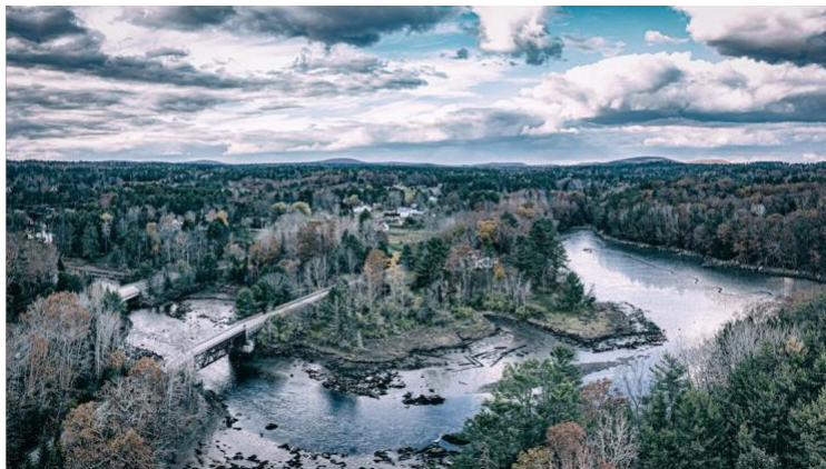
Railroad bridge and City Point Road bridge, Belfast, Maine. Mid-day, low tide, early November.

Gallery Position: 28 SKU: 153 Capture Date: 11/3/21 Camera: Air 2S