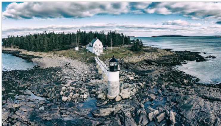
Lighthouse on Marshall Point, marking entrance to Port Clyde

Gallery Position: 12 SKU: 76 Capture Date: 12/4/18 Camera: Mavic Air