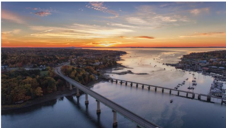
Sunrise on Belfast harbor, over Route 1 bridges Mid-autumn.

Gallery Position: 10 SKU: 8 Capture Date: 10/20/16 Camera: Phantom 4