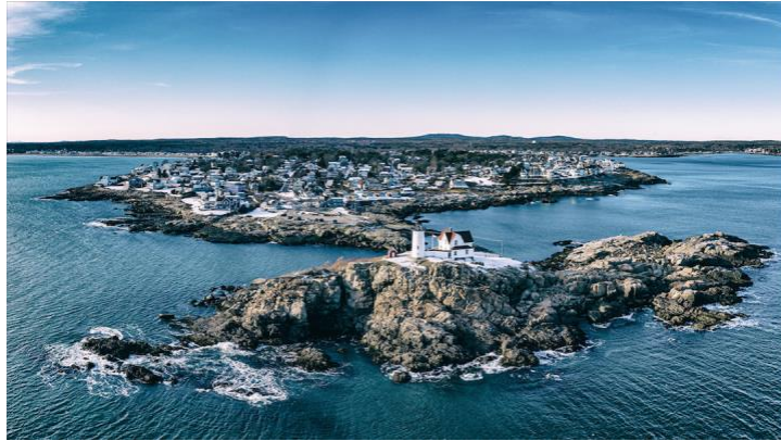
Nubble Lighthouse, York, Maine. Winter. Offshore view looking west over lighthouse to Cape Neddick and York.

Gallery Position: 3 SKU: 91 Capture Date: 12/12/19 Camera: Mavic 2 Pro