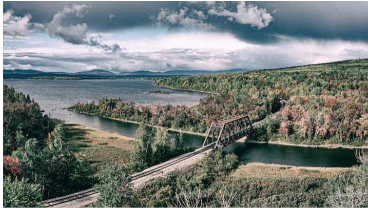
Canadian Atlantic Railway crossing at Attean Pond, Jackman, Maine.

Gallery Position: 27 SKU: 150 Capture Date: 9/30/21 Camera: Mavic 2 Pro