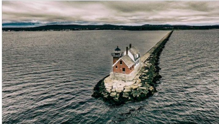
Breakwater and lighthouse in Rockland Harbor. Rockport's Samoset Resort beyond.

Gallery Position: 19 SKU: 12 Capture Date: 5/4/16 Camera: Phantom 4