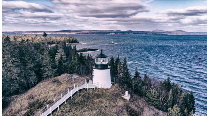
Owls Head Lighthouse. Camden Hills, Rockland and breakwater in distance beyond.

Gallery Position: 11 SKU: 74 Capture Date: 12/4/18 Camera: Mavic Air