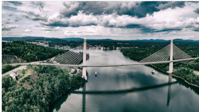
Penobscot Narrows Bridge. Crossing Penobscot River at Bucksport.

Gallery Position: 20 SKU: 49 Capture Date: 9/10/17 Camera: Mavic Pro