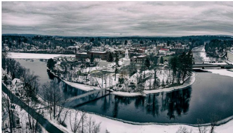
Swinging Bridge Skowhegan, ME. Over Kennebec River. View from South bank to Weston Island.

Gallery Position: 4 SKU: 103 Capture Date: 1/25/20 Camera: Mavic Mini